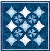
Triangle in a Square

Use the uniquely double sided foundation paper to make the blocks and border blocks for a 24" square practice kit. Arrange by rotating or combining regular and mirror blocks for unlimited options.